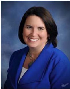
Kelli Stargel *** Florida Senate Lakeland