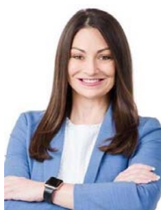
Nicole Fried *** Florida Department of Agriculture & Consumer Services Tallahassee