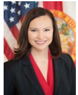
Ashley Moody *** Florida Office of the Attorney General Tallahassee