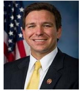
Ron DeSantis